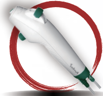
Ambu® aScope™ 4 RhinoLaryngo Intervention