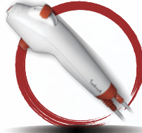
Ambu® aScope™ 4 Broncho Large