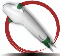
Ambu® aScope™ 4 Broncho Regular