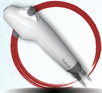
Ambu® aScope™ 4 Broncho Slim