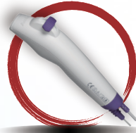
Ambu® aScope™ 4 RhinoLaryngo Slim